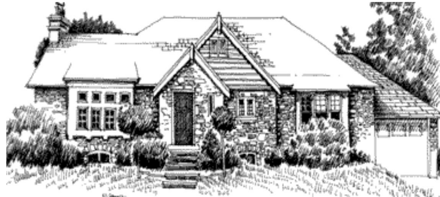
An original Thompson Orchard cottage

Since then, the Development Committee has worked to protect the physical character of the Thompson Orchard neighbourhood through outreach to homeowners planning to renovate or build, education of all relevant parties regarding our neighbourhood-specific by-law and, if necessary, advocacy in front of the Committee of Adjustments and the Ontario Land Tribunal. Recent government changes in provincial and city planning legislation and rules have made this challenging.